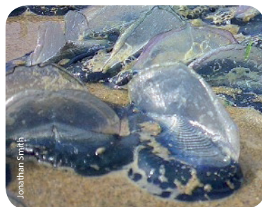
By The Wind Sailor (a hydranth)