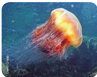
Lions mane (stings)