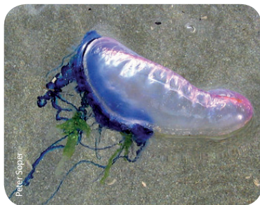
Portuguese Man-O-War (stings. A floating colony of hydrozoans)