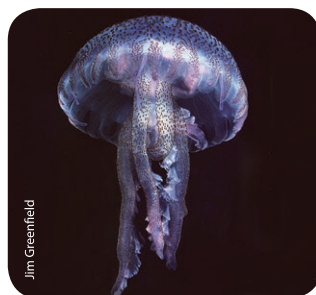
Mauve Stinger (stings)